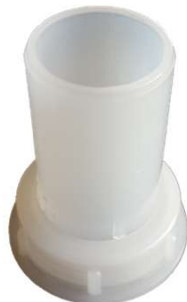
Spout ø 27mm L 48mm Holed cap Art.Nr. co8087