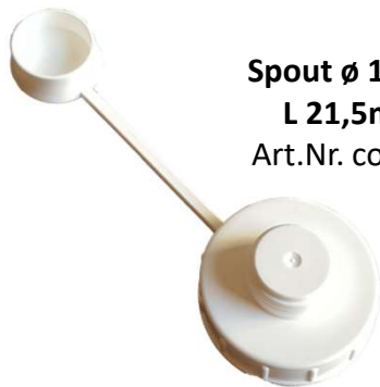
Spout ø 19mm L 21,5mm Art.Nr. co8107