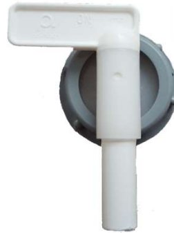
Tap ø 11mm Holed cap grey Art.Nr. co8099