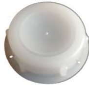
Screw cap w/o tamper evident Art.Nr. co8103