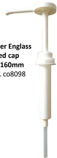
Dispenser Englass Holed cap Tube 160mm Art.Nr. co8098