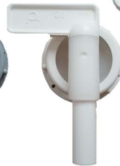
Tap ø 11mm Holed cap white Art.Nr. co8096