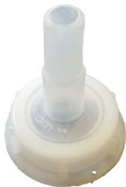
Spout ø 8mm L 48mm Holed cap Art.Nr. co8079/co8026