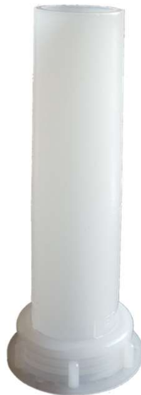
Spout ø 27mm L 105mm Holed cap Art.Nr. co8087