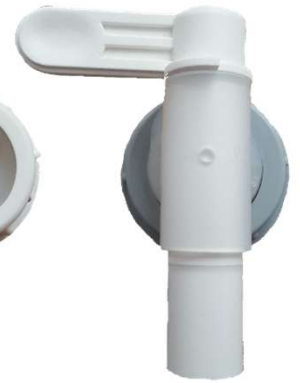
Tap ø 16mm Holed cap grey Art.Nr. co8103