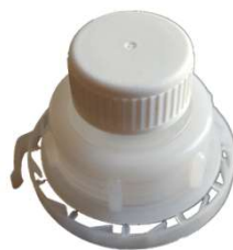
Spout (3 Parts) ø 19mm /L 35mm Art.Nr. co8092