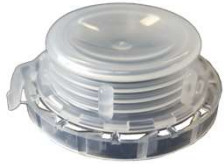
Screw cap tamper evident Art.Nr. co8011